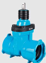
450-00 Gate valve „E3“ with sockets - BAIO® system