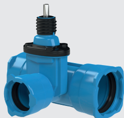
437-00 Combi-T gate valve „E3“ - BAIO® system