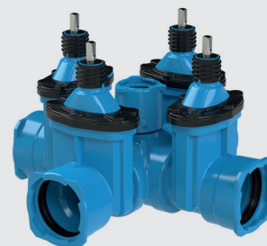
439-00 Combi IV gate valve „E3“ - BAIO® system