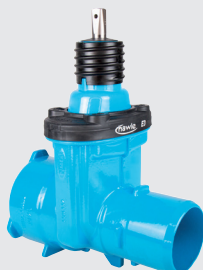
451-00 Gate valve „E3“ with spigot/socket - BAIO® system