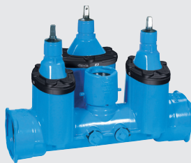
438-00 Combi III gate valve „E3“ - BAIO® system